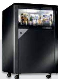
RH 456 LD: free-standing version

Door decor panels Left hand door hinge (project orders)